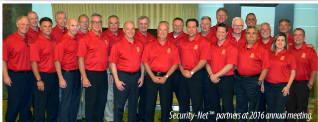
Security-Net™ partners at 2016 annual meeting.

Our valued partners and their territories cover the United States, Canada and abroad. To learn more about Security-Net™ and our partners, visit www.security-net.com .